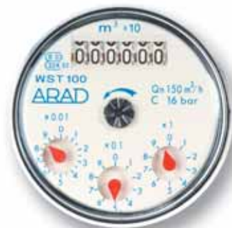
WST type dial