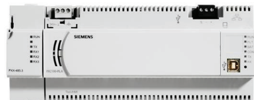
Figure 5. RS-485 Expansion Module and PXC Modular.