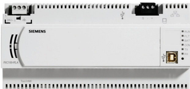
Figure 1. PXC Modular.